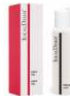
Content: 125 ml Item.-No.: idpelgslot 2.5 <pH <3.5