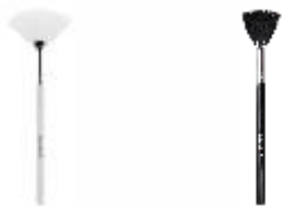
30 mm x 22 mm, total length: 190 mm Item.-No.: idbrush01 (white) idbrush02 (black)