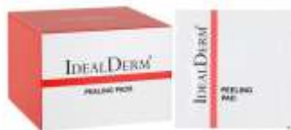
Content: 14x peeling pads Item.-No.: idpelgspad Very practical and hygienic, individually packed!